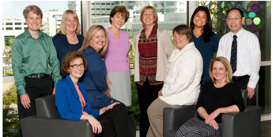
Members of the clinical, biostatistics and informatics cores of the UC Davis Department of Surgery Data Coordinating Center.